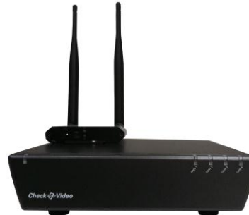
Figure 1: Front view of appliance