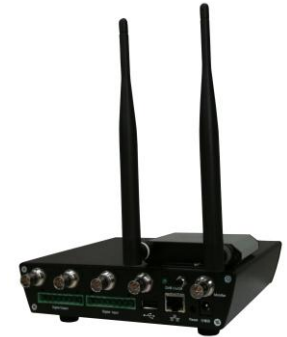
Figure 2: Back view of appliance