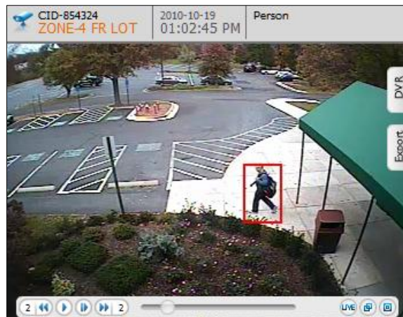
Figure 1: Video alarm clip as presented to operator